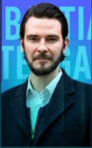
JOE & THE JUICE